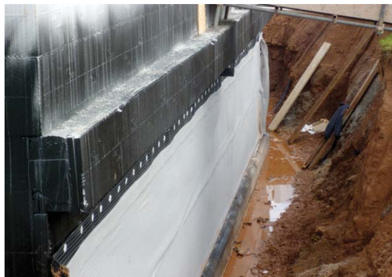
Figure 7: External waterproofing system.