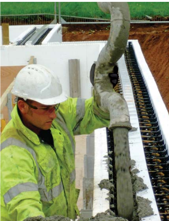
Figure 1: ICF concrete pour at project.