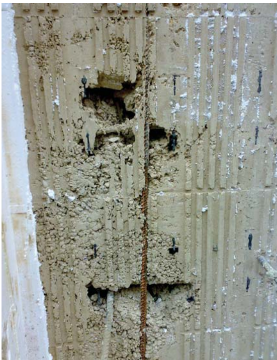
Figure 2: Poorly compacted concrete.