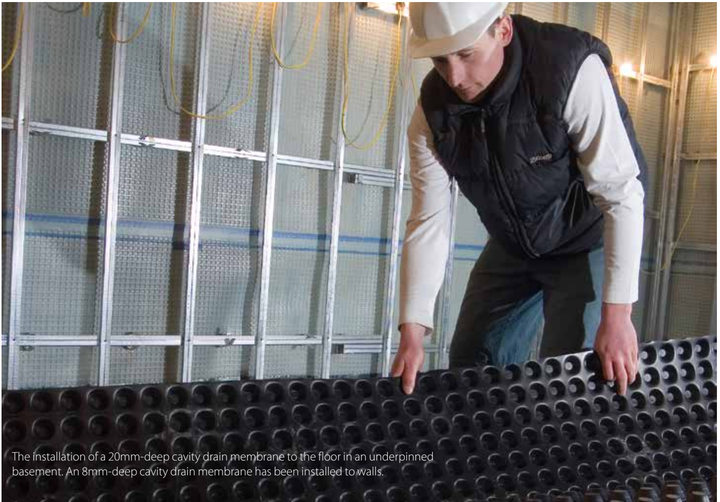
The installation of a 20mm-deep cavity drain membrane to the floor in an underpinned basement. An 8mm-deep cavity drain membrane has been installed to walls.