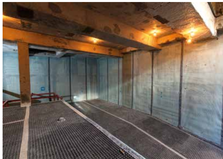
A typical Type C structural waterproofing system using cavity drain membranes on the walls and floor in an underpinned multi-level domestic basement.

membrane and care is still required to ensure that the ingress of 'free lime' is restricted by using a sealer over the dry pack area and by ensuring that an anti-lime dressing is applied over the new concrete walls and floor. The cavity drain system can be accessed for maintenance and inspection via ports fitted to the drainage channel, particularly important in these situations as the 'free lime' can clog the channel and pumps if not monitored and dealt with.