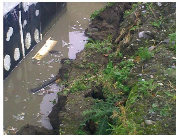
Areas of collapse prior to commencement

Designed by Cork based Triton Conservation Systems, the system was installed at a new residential property after a water bar detail had failed at the floor/wall junction and the mass concrete walls at basement level were also weeping due to failure of the waterproof concrete.