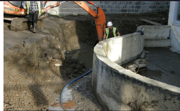
Excavation works in progress