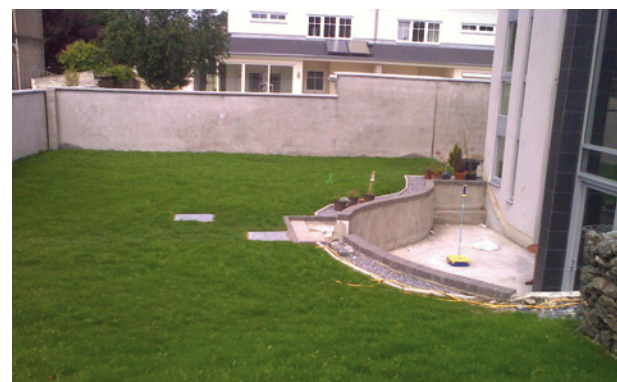
Works completed and property landscaped