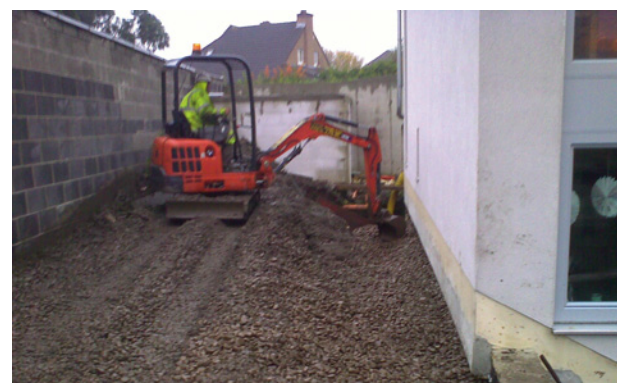
New back filling