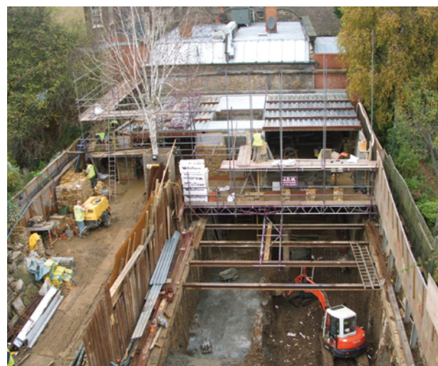
Digging out to extend the basement beneath both the garden and the building at the far end of the property

The new subterranean room accommodates a swimming pool and is covered with a 300 M 2 turf roof. Triton's TT Vapour Membrane was used as the primary method of waterproofing the new ground slab (basement roof) and this was covered with Platon Double Drain membrane to form a protective layer for the primary waterproofing and a drainage layer for the turf roof construction.