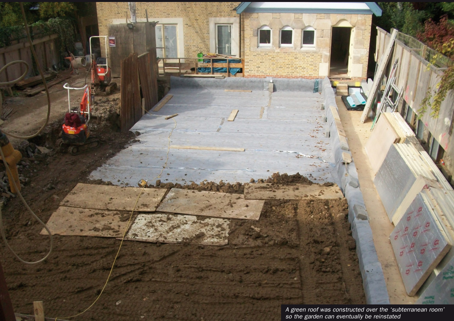
A green roof was constructed over the 'subterranean room' so the garden can eventually be reinstated

Platon Double Drain cavity drain membrane (300 M 2 )