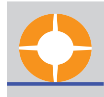
Cast in place

The tubing is then placed on the flat surface and fixed onto the concrete with clips at approximately 200 to 300mm centres throughout the required length. At either end of the hose, there are 200mm-500mm lengths of hose, these are colour coded blue and clear, this helps to identify where one length starts and the other end finishes. There are two alternative ways of forming the injection points. The standard way is for these lengths to be placed through the formwork to provide easy access when the injection work is required.